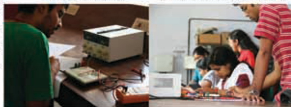
Events of ASTHRA '15