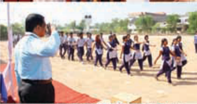
COLLEGE DAY AND SPORTS DAY INAUGURATION