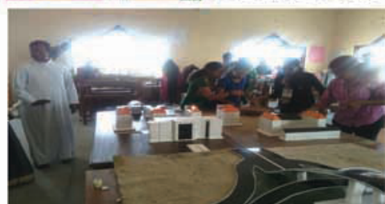
Exhibition organized in connection with Srishti-2015