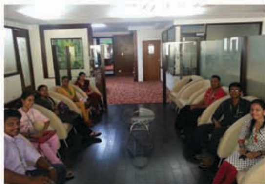
One-day soft skill training programme for selected 10, S6 students on March 20th at the Technopark Campus by NEST

CGPU arranged an awareness programme for attending GATE 2016 for pre final year students. The session was handled by eminent persons from GATE FORUM.