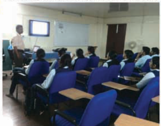
Intensive Training program on Communicative English