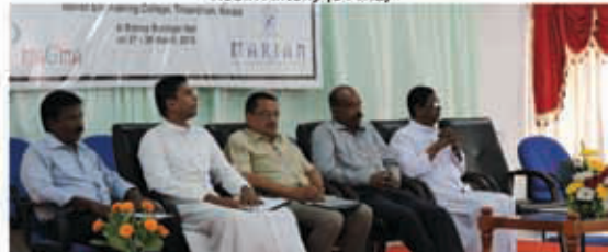
National Conference "NCERTIA'15" organized by Dept. of ME on 27 th and 28 th March, 2015