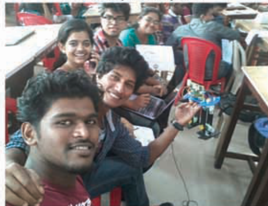
Snap Shot of S6-AEI students who participated at IIT Mumbai as part of 'INDO-US-ROBO' Games.