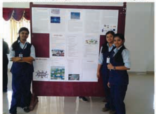
Poster Presentation by the students during VIDYUT 2015