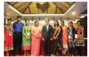
Faculty and students at International Conference on "Geotechniques for Infrastructure Projects"