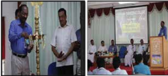
Lamp Lighting Ceremony by Chief Guest Dr. K.Sivan , Director,VSSC