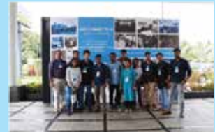
Team Marian IEDC at IEDC 2017 Summit, organized by Kerala StartUp Mission