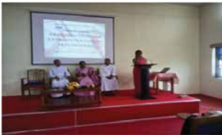
FDP on "Embedded systems and hands on training on Keil and Arduino ID"