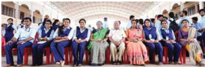
STARS OF DEPARTMENT OF CIVIL ENGINEERING