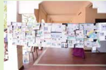
Clips of Competitions Conducted on 17th February