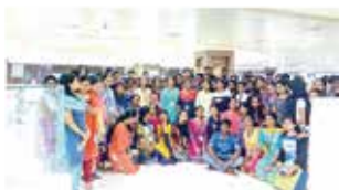
Industrial visit to Cochin International Airport Ltd

Department of Civil Engineering has organized a one day visit to Cochin International Airport Ltd. on 9th February, 2017 for 2014-2018 batch S6 civil engineering students.