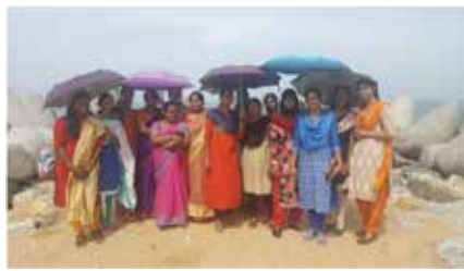
Field visit on 7th July 2017 as part of FDP "Analysis of Indeterminate Structures"