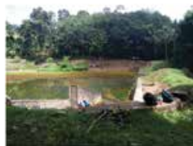
Survey camp for the 2014-2018 Batch students at Nedumangad, on 18th and 21st of July 2017.