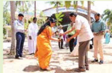
Planting Trees to enrich the GreenFest