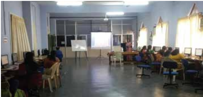
FDP on 'Python & R Programming'