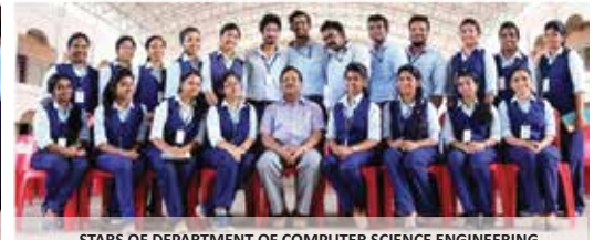
STARS OF DEPARTMENT OF COMPUTER SCIENCE ENGINEERING