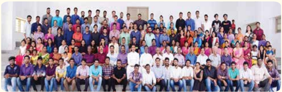
Alumni Meet on 11th February, 2017