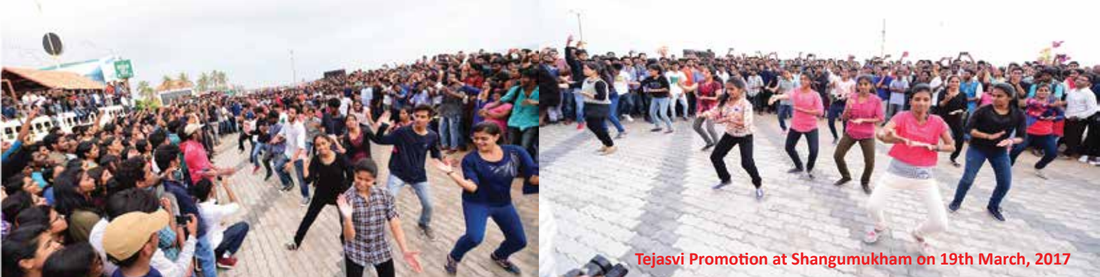
Tejasvi Promotion at Shangumukham on 19th March, 2017