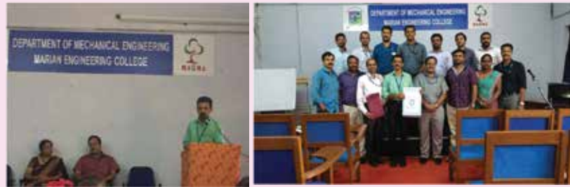
FDP shots from 3rd to 7th July, 2017