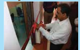
Inauguration of Marian Incubation facility