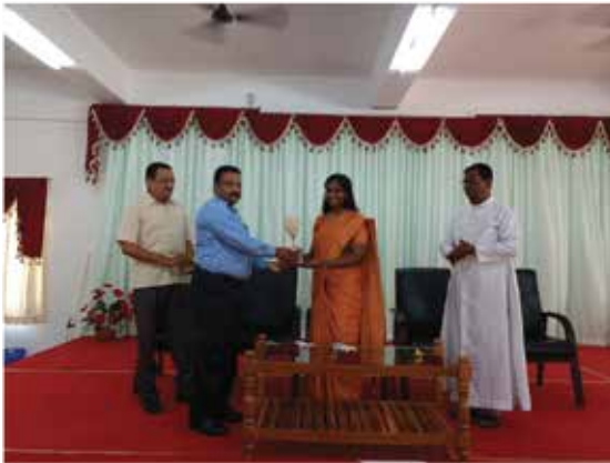
Embrace and Empower by IEEE on 8th March 2017