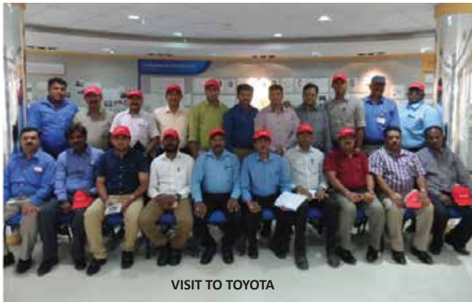
VISIT TO TOYOTA