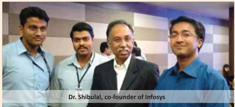
Dr. Shibulal, co-founder of Infosys