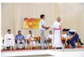
STARS OF DEPARTMENT OF ELECTRONICS & COMMUNICATION ENGINEERING