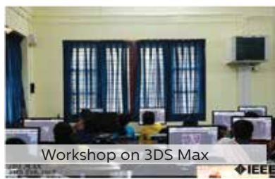
Workshop on 3DS Max