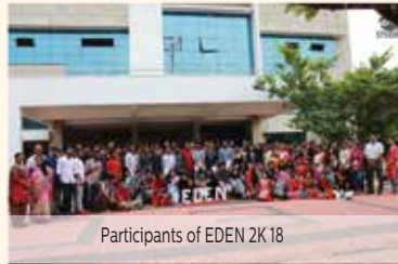
Participants of EDEN 2K 18