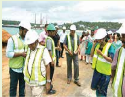
Faculty of Civil Engineering Department visiting Vizhinjam Harbour