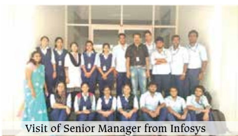
Visit of Senior Manager from Infosys