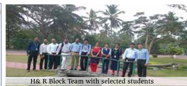
H&R Block Team with selected students