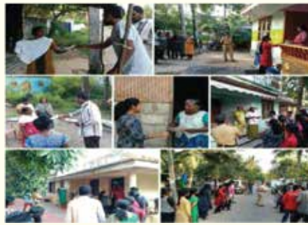
A house visit to Fathimapuram was conducted jointly by NSS Marian unit and Kazhakuttom Excise Dept. to educate the locals about the consequences of drug abuse and was completed by 6 pm.