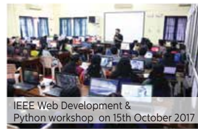
IEEE Web Development & Python workshop on 15th October 2017