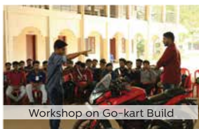
Workshop on Go-kart Build