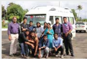
Team IEDC participated in YES CAN 2018 organised by KSIDC on 12th September 2017 at Cochin.