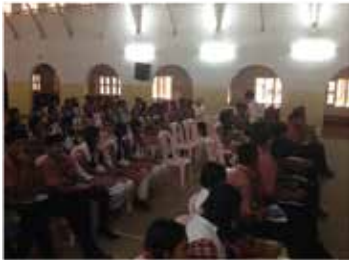
Marian IEDC event at JyothiNilayaam School

In continuation with the suggestion form KSUM, Marian IEDC extended its operation to the nearby schools by offering programs to High School students. The program was formulated as a three hour session, which focused on general awareness about innovation & Entrepreneurship Development. Soft Skill development was conducted by Artil Solutions, the Start Up which was registered in IEDC. The program was conducted at Pallithura High School on 2nd January 2018 and at JyothiNilayaam School at 5th January 2018.