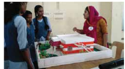
TECH VIBES 2017-Project Exhibition on 11th October, 2017 presented for the various school students