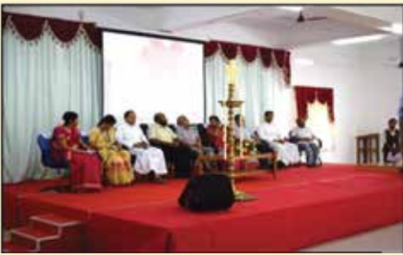
Dignitaries on dais - National Conference on Innovations in Civil Engineering – 2018