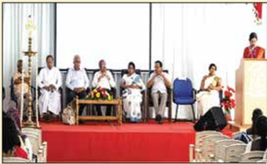
Dignitaries on dais - IGS student Chapter inauguration at Marian Engineering College