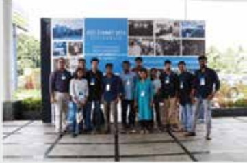
Team IEDC participated in IEDC SUMMIT Organised by KSUM at Angamally on 18/08/2017