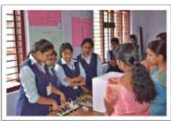
Stills of TechVibes Project Expo held on 11th October, 2017