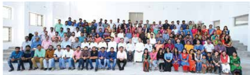
Marian 'ALUMNI MEET' held on 23rd Decemeber, 2017