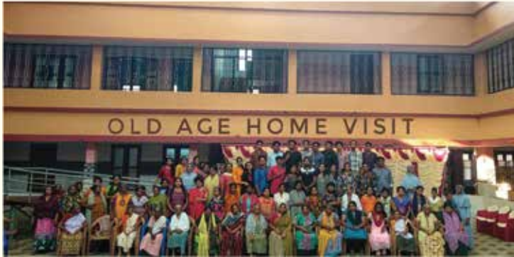
On 25/2/2018 volunteers visited old age home, Sadhana Renewal Center, at Monvila and comforted the inmates. 28 volunteers participated in this charity activity.