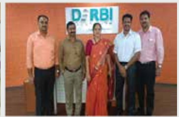
A three member faculty delegation went to DERBI Foundation, the private incubator in Bangalore.