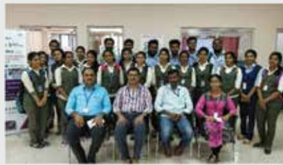
Delegation team of IEDC, which includes 30 students and two faculty visited TIMed, the incubation center of SCTIMST on 5th October 2017.