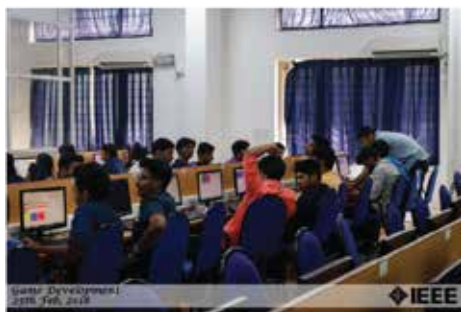
Workshop on Game Development held on 25th February 2018