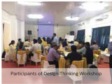
Participants of Design Thinking Workshop