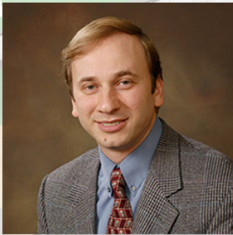
Erol Tutumluer, Ph.D. Chairman TC-202 (ISSMGE)

The goal of Technical Committee (TC) 202 is to apply broad engineering to bridge the gap between Pavement/Railway Engineering and Geotechnical Engineering. The main task is to promote co-operation and exchange of information and knowledge about the geotechnical aspects in design, construction, maintenance, monitoring and upgrading of roads, railways, airfields and harbor facilities. The task also covers the related environmental aspects. TC 202 has identified eight task forces for achieving its goals. Several conferences and workshops are being organised all around the world for the purpose.