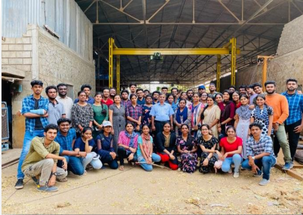
Industrial Visit to Nellai Concrete, Product & Construction Company (P) Ltd., Gangaikonda, Tamilnadu