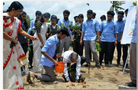
Planting a sapling for a Greener Earth