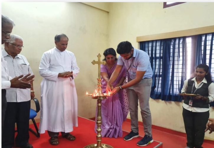
Inaugural ceremony of IEI MEC CE student chapter