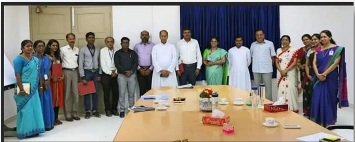
Faculty and management of Marian Engineering College with delegates of BIMLABS and EICL

5. MoU was signed with BIMLABS and EICL on 31 st January 2020. The MoU aims to improve employability skills of faculty and students and provide an opportunity to the students to take up socially relevant projects.