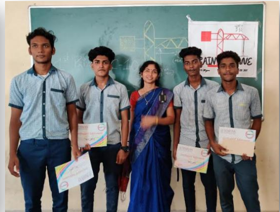
Prize winners of "BRAIN CRANE", a technical event conducted as part of QURIO'19

4. MoU were signed with UNO Technology Private Limited and Qcrete Ready-mix (INDIA) Pvt on 9 th January 2020.