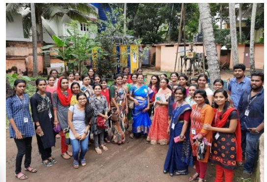
M. Tech students at Govt. UPS, Ambalathara