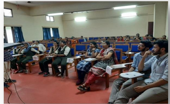
IGSMA 2.0, Technical quiz organized by IGS Student Chapter