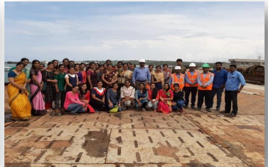
M.Tech students and faculty with officials at Vizhinjam Harbour