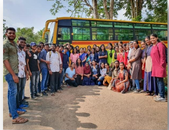
Industrial visit to Neyyar Dam