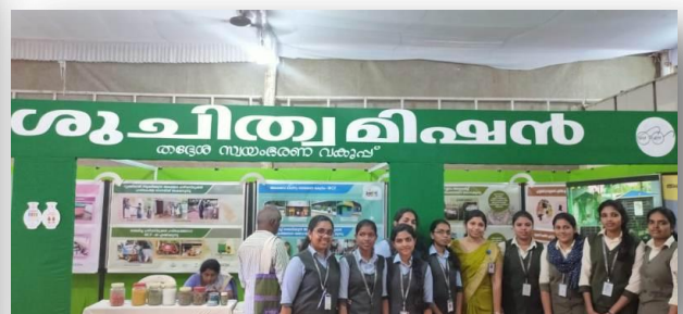
Visit to Exhibition organised by Haritha Kerala Mission