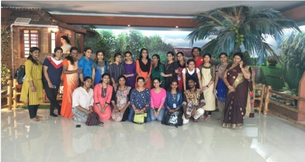
Industrial visit to Kerala Soil Museum